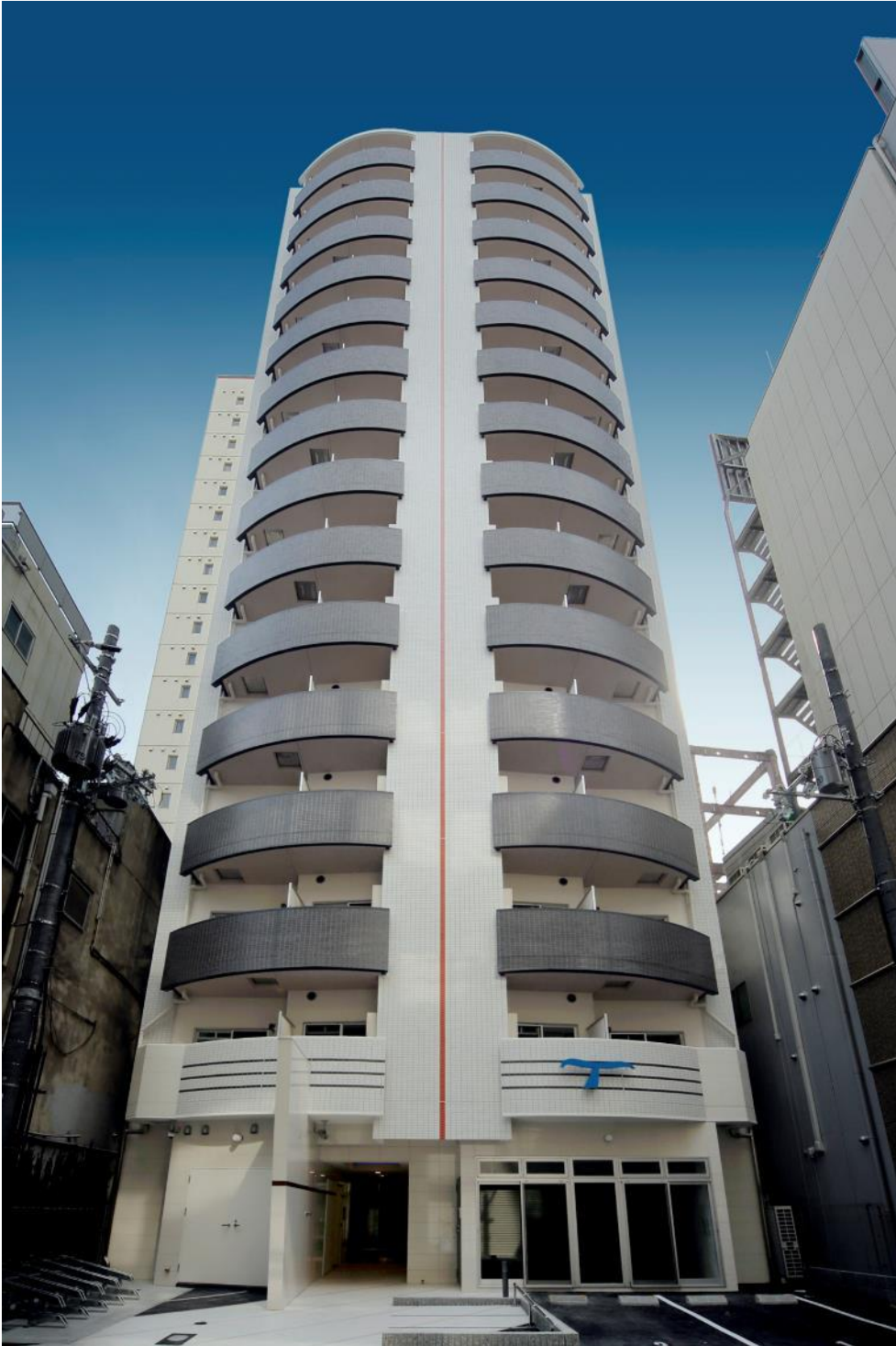
O-6-153 Serenite Umeda EST

The following is an English translation of the original Japanese press release and is being provided for informational purposes only.