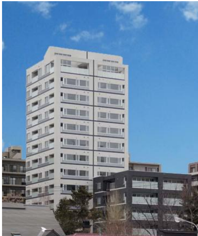
(Real estate in trust photographed from the far south-west side)