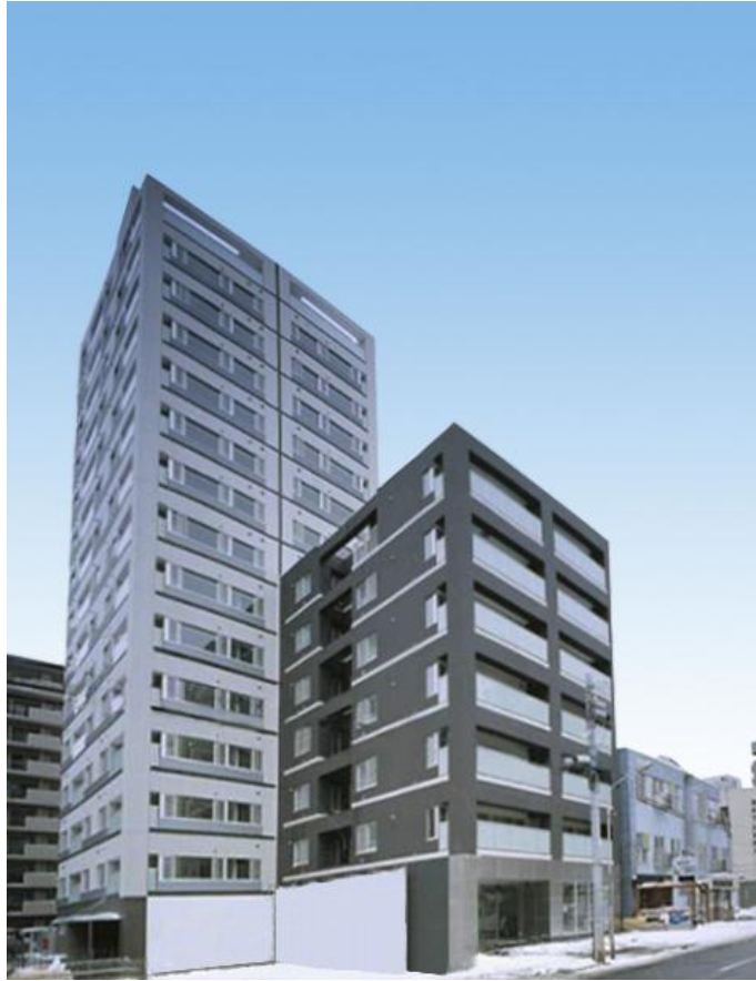
(Real estate in trust photographed from the south-west side)

(Reference Material II) Photograph of Property to be Acquired (Both the High-Rise Building and the Low-Rise Building)